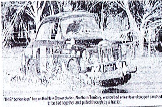
This "bottomless" bog on the New Cream station, Northern Territory, was so bad entrants and support cars had to be tied together and pulled through by a tractor.